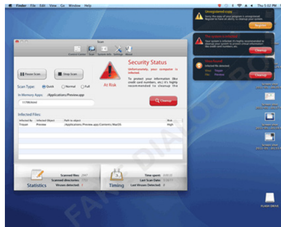
Figure 1. Fake dialog box informing users that their systems are infected

Sold for US$40-100 each, cybercriminals generate huge profits from the buyers of rogue antivirus software.