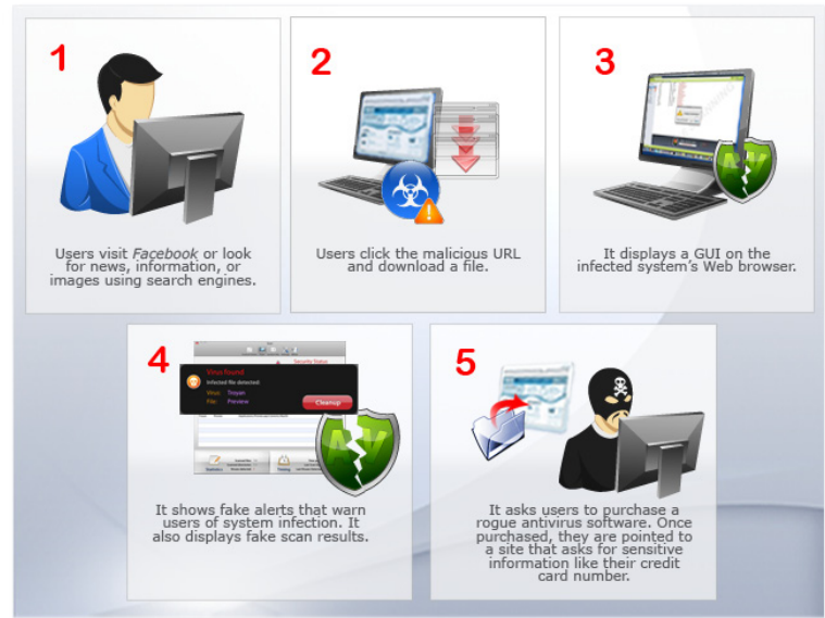
Figure 2. Typical FAKEAV for Macs infection diagram

OS X ! In just one month, the malicious landing pages obtained almost 300 million hits, 7.3 percent or approximately 21 million of which came from Mac users.